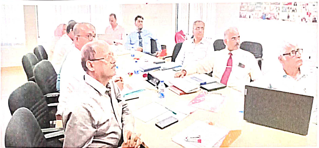
Engrossed in the presentation