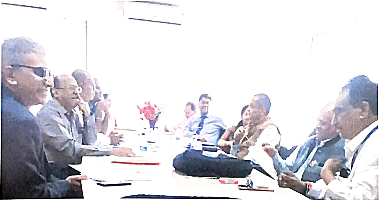
Discussions in progress